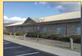
Noyes Mental Health and Wellness Services 9221 Robert Hart Drive Dansville, NY 14437