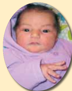
Noyes' First Baby of 2016

ability of hospitals with varying resources to implement standardized approaches to obstetric hemorrhage, severe hypertension in pregnancy, and venous thromboembolism. Noyes Health has implemented the Safe Motherhood tool kit of three care management plans, offering practical implementation guidance and teaching tools to help eliminate variation in diagnosis, management, consultation and referral.