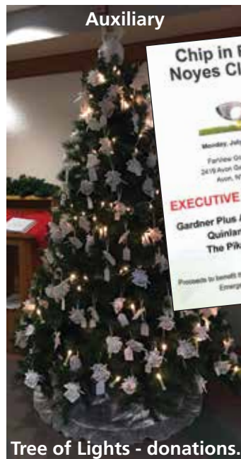
Tree of Lights - donations.