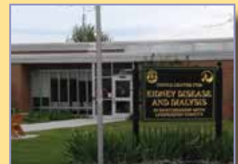
Noyes Kidney Disease and Dialysis Center 4616 Millennium Drive Geneseo, NY 14454