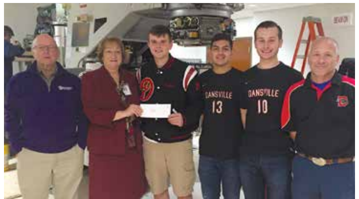
The Dansville High School Mustangs boys' soccer team earned money for each goal they scored during the fall season, raising $1,400 for the Cancer Center.