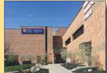
Noyes Memorial Hospital 111 Clara Barton St. Dansville, NY 14437