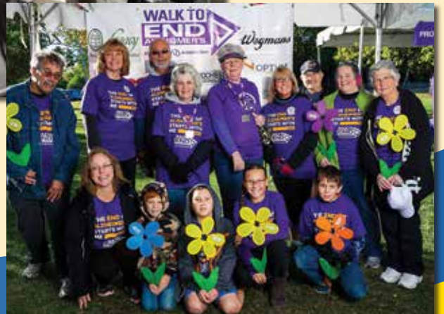
In October, the Noyes Cares Team walked in the Walk to End Alzheimer's in Geneseo, and raised $1,550 to support Alzheimer's research and support services/programs in Livingston County.