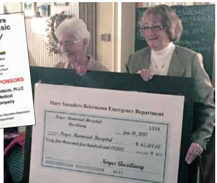
Proceeds from all Auxiliary endeavors support Noyes.