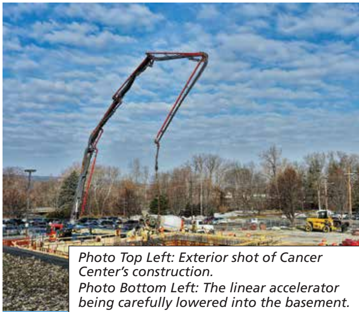
Photo Top Left: Exterior shot of Cancer Center's construction. Photo Bottom Left: The linear accelerator being carefully lowered into the basement. Photo Bottom Right: Closeup of the linear accelerator. Photo Top Right: Exterior shot of Cancer Center Extension.

In December, the Cancer Center was ready for its debut. Noyes invited the community in to see what its support had accomplished: the dream of comprehensive, state-of-the-art cancer care close to home had become reality.