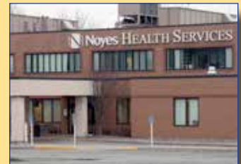
Noyes Health Services 50 E. South St. Geneseo, NY 14454